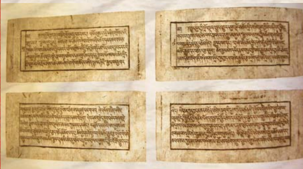
The Dalai Lama's Last Testament

In his Testament, he prophesized: “Teachings shall be wiped out completely. Monasteries shall be looted, property confiscated and all living beings shall be destroyed. The property of the officials shall be confiscated; they shall be slaves of the conquerors and shall roam the land in bondage. All souls shall be immersed in suffering and the night shall be long and dark.”