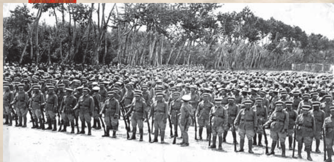
The Dalai Lama understood the importance of a Tibetan Army

In his Testament, he prophesized: “Teachings shall be wiped out completely. Monasteries shall be looted, property confiscated and all living beings shall be destroyed. The property of the officials shall be confiscated; they shall be slaves of the conquerors and shall roam the land in bondage. All souls shall be immersed in suffering and the night shall be long and dark.”