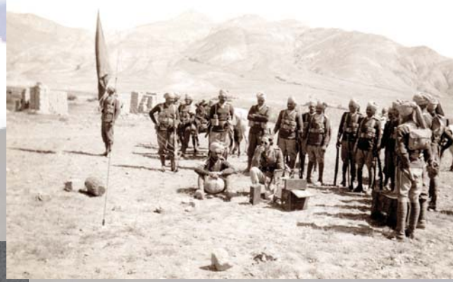
The troops of British India trained the Tibetan Army