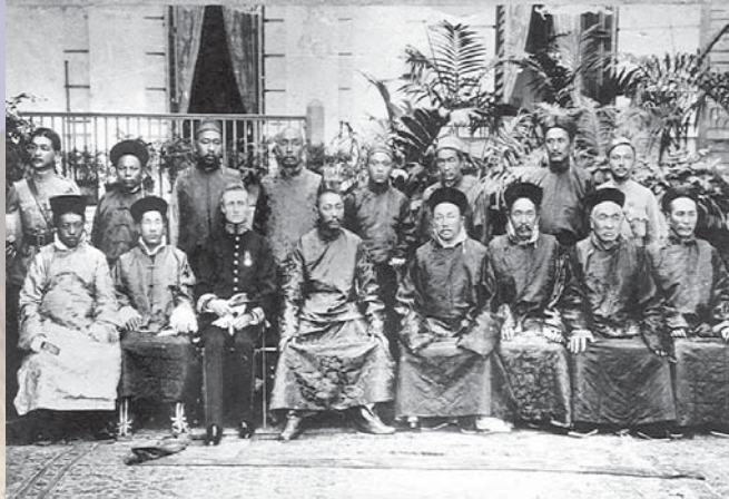
The Dalai Lama, his Cabinet and Sir Charles Bell His friendship with the British diplomat helped Tibet to come out of its isolation