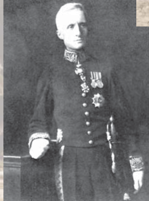
Sir Charles Bell