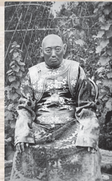
Portrait of the 13th Dalai Lama

Thubten Gyatso, the Thirteenth Dalai Lama was in many ways a remarkable leader. He sent young Tibetans to England to be educated; he wanted Tibet to join the League of Nations; he started building a modern army; he reformed the monastic discipline. Unfortunately, he had to deal with conservative forces obstructing his reforms and wanting to keep Tibet isolated.