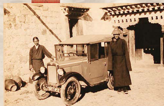
The Dalai Lama introduced the first car on the Roof of the World