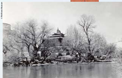
Lukhang Pavilion where he often spent time

In my Palace, the place of Heaven on Earth They call me Rigzin Tsangyang Gyaltsso But below, in the village of Shol They call me Dangzang Wangpo, The profligate, for my lovers are many.