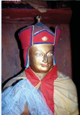
Tsangyang Gyatso the 6th Dalai Lama

Tsangyang Gyatso was born in 1683 in Tawang district of Arunachal Pradesh. He was already an adolescent when he was taken to Lhasa to be enthroned by his guru, the Panchen Lama Lobsang Yeshe, as the 6th Dalai Lama. Still remembered for his exquisite poetry which has been sung for generations around a fire with a few cups of Tibetan beer, he is also considered a great tantric master who could appear at different places at the same time.