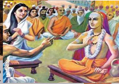
Adi Shankara incorporated several Buddhist tenets into Hinduism while converting many Buddhists.