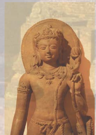
With the decline of the Pala Dynasty, royal patronage shifted from Buddhism to Hinduism.

The decline of the Buddhist faith in the Indian subcontinent had incalculable consequences for the Roof of the World. Four factors are usually mentioned to explain this decline: the revival of Hinduism mainly after the conversions undertaken by Adi Shankaracharya; the degeneration of Buddhism; the loss of princely patronage in Northern India. The coup de grâce came with the arrival of the Turkish armies who slaughtered monks and destroyed the viharas .