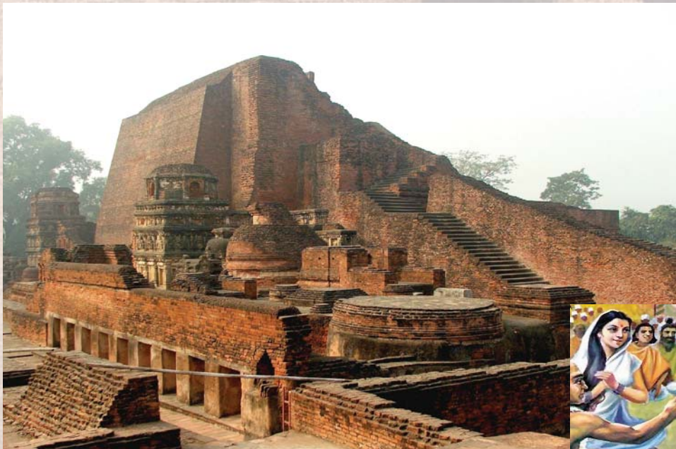
Ruins of Nalanda Vihara