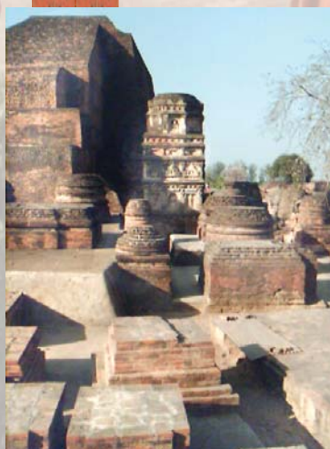
Dharmasvamin (Chag Lotsawa) may have carried his guru between these buildings

A Tibetan monk, Dharmasvamin who visited Nalanda in 1235 witnessed only destruction. He could not recover a single manuscript from what was once, one of the richest libraries of the world. He could however meet a 90 year old monk who taught him Sanskrit. When he was warned that the Muslim troops were approaching, he carried his master on his shoulders and hid until the raiders had gone. This image symbolized the end of India's cultural influence over Tibet.