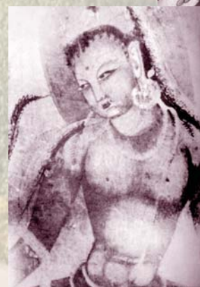
Some of the Indian artists who migrated to Western Tibet may have painted these exquisite frescoes.