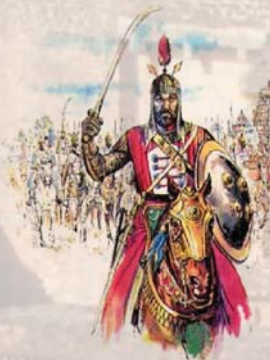
Mohammed Ghori and his descendants destroyed Nalanda

The decline of the Buddhist faith in the Indian subcontinent had incalculable consequences for the Roof of the World. Four factors are usually mentioned to explain this decline: the revival of Hinduism mainly after the conversions undertaken by Adi Shankaracharya; the degeneration of Buddhism; the loss of princely patronage in Northern India. The coup de grâce came with the arrival of the Turkish armies who slaughtered monks and destroyed the viharas .