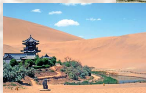
Little is known of the relations between Yarlung and Central Asia (here Dunhuang)