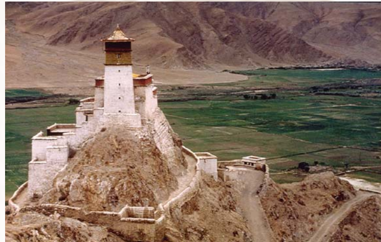
Yumbulagang Palace in Yarlung Valley

Legend says that in 127 BCE, the inhabitants of Yarlung Valley elevated Nyatri Tsanpo as the first king of Pugyal (or Yarlung) Dynasty. Nyatri, the story continues, descended as a god-like being from the sky using a 'sky-rope.' When he landed, he met some herdsmen grazing their yaks; they took him on their shoulders and made him king. The seven first kings are said to have used a rope to leave this world after their death. They have left no tombs.