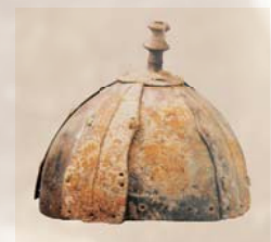
Helmet and Arrows