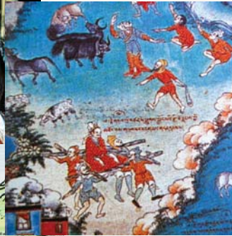
Representations of the legend of the First King