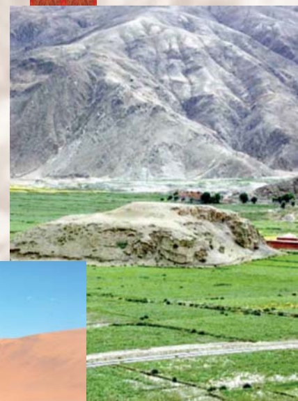
Mounds of the tombs of the Kings in Chongye, Yarlung Valley