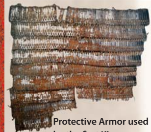
Protective Armor used by the first Kings

More prosaically, historical research on the relations between the neighbouring kingdom of Zhangzhung and the Yarlung Dynasty is still in its infancy. The hypothesis of the existence of a script has not yet been elucidated.