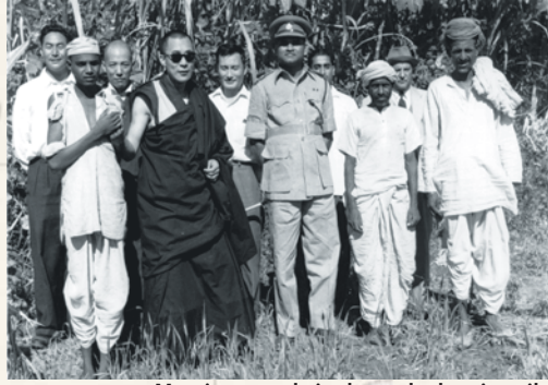
Meeting people in the early days in exile