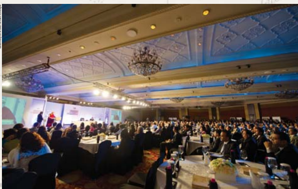
Addressing a conclave in Delhi