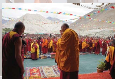
In Zanskar (2012)