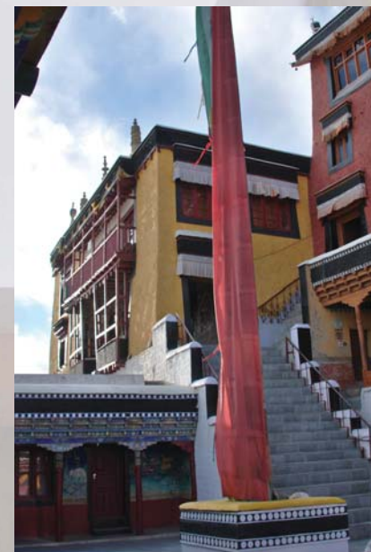
Many monasteries have been rebuilt