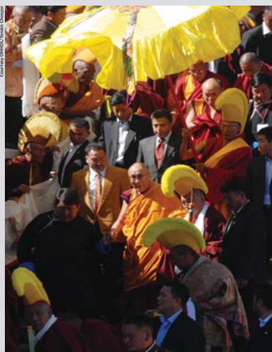
The Dalai Lama in Tawang (2012)

In recent years, these remote areas of India have experienced a cultural and religious renaissance under the guidance of the Dalai Lama who has visited the Himalayan region over fifty five time.