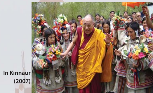
In Kinnaur (2007)