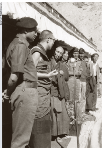
The Dalai Lama with Kushok Bakula Rinpoche