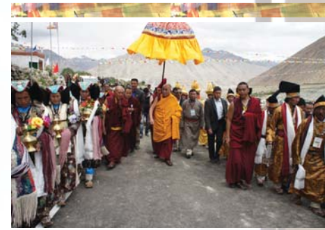
The Dalai Lama received by Ladakhi folks in traditional attire (2012)

The Himalayas have an age-old connection with Tibet. For centuries, inhabitants of the great mountain range have shared a common spiritual search and a similar way of life with Tibet. The past has seen a constant flow of Tibetan lamas and monks crossing the high passes on their way to the illustrious Indian viharas while Indian yogis and pundits often visited the Land of Snows. A large majority of the Himalayans, from Ladakh to Tawang still follows the Dharma of Buddha.