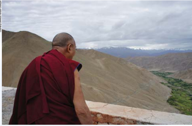
Looking at the Himalayas....