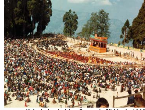
Kalachakra held at Gangtok, Sikkim in 1993

The Himalayas have an age-old connection with Tibet. For centuries, inhabitants of the great mountain range have shared a common spiritual search and a similar way of life with Tibet. The past has seen a constant flow of Tibetan lamas and monks crossing the high passes on their way to the illustrious Indian viharas while Indian yogis and pundits often visited the Land of Snows. A large majority of the Himalayans, from Ladakh to Tawang still follows the Dharma of Buddha.