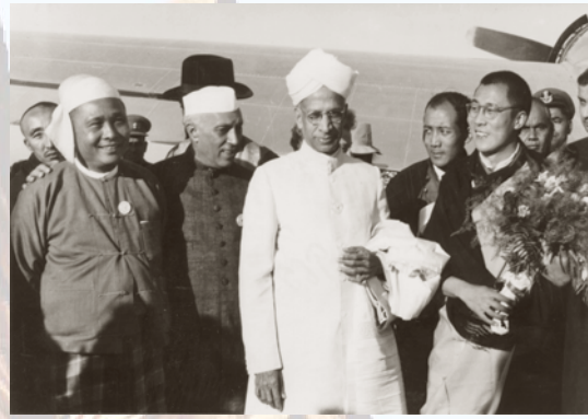
With Vice-President S. Radhakrishnan and Prime Ministers J. Nehru (India) and U Nu (Burma)

On his arrival in India in April 1959, Nehru sent a message to the Dalai Lama: "My colleagues and I welcome you and send greetings on your safe arrival in India. We shall be happy to afford the necessary facilities to you, your family and entourage to reside in India. The people of India, who hold you in great veneration, will no doubt accord their traditional respect to your personage."