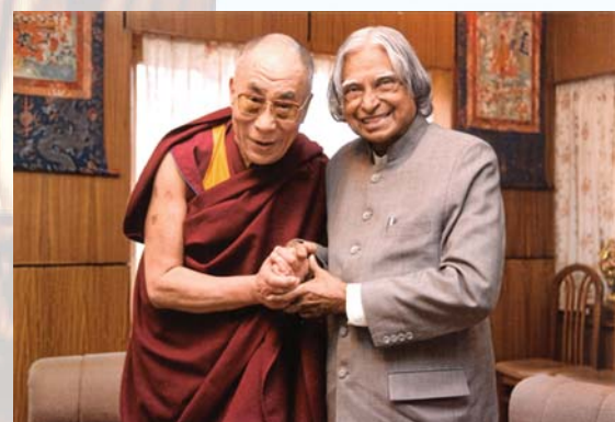
With President A.P.J. Abdul Kalam