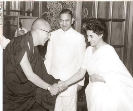
With Prime Minister Indira Gandhi