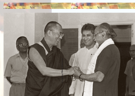
With Prime Minister I.K. Gujral