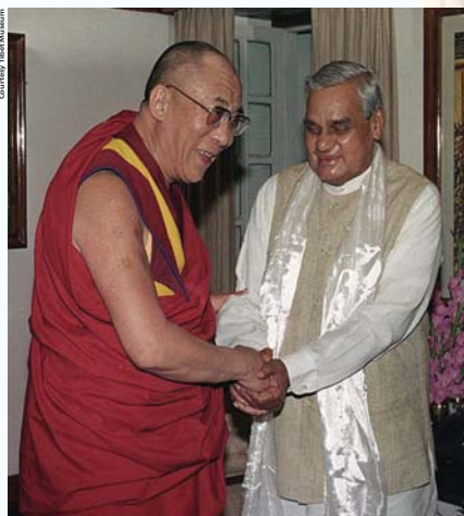
With Prime Minister Atal Bihari Vajpayee