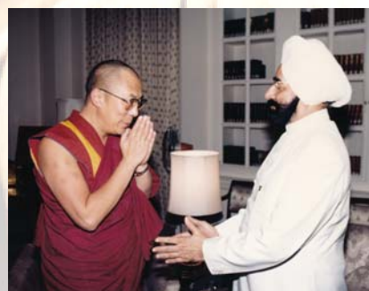
With President Gyani Zail Singh

In 2009, Prime Minister Dr. Manmohan Singh clarified again the status of the Dalai Lama. He told his Chinese counterpart: "The Dalai Lama is our honoured guest in India, ...the Dalai Lama is free to travel anywhere he wishes to in India."