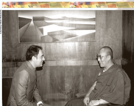
With Prime Minister Rajiv Gandhi

In 2009, Prime Minister Dr. Manmohan Singh clarified again the status of the Dalai Lama. He told his Chinese counterpart: "The Dalai Lama is our honoured guest in India, ...the Dalai Lama is free to travel anywhere he wishes to in India."