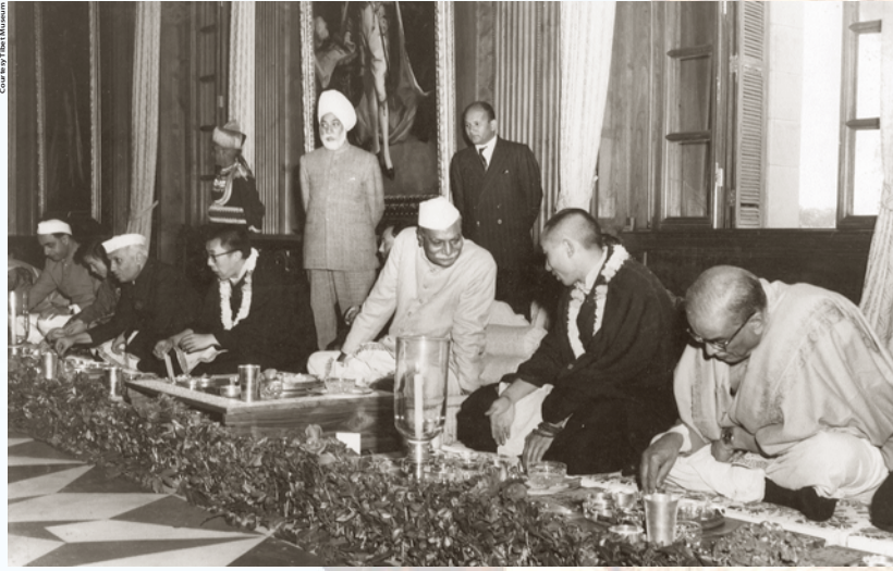
Between Prime Minister Nehru and President Rajendra Prasad in 1956