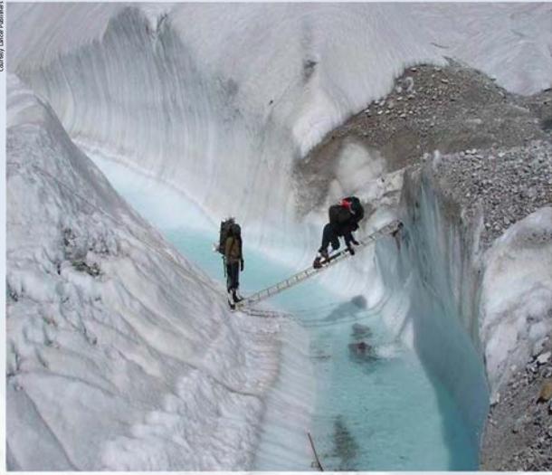
On the Siachen Glacier