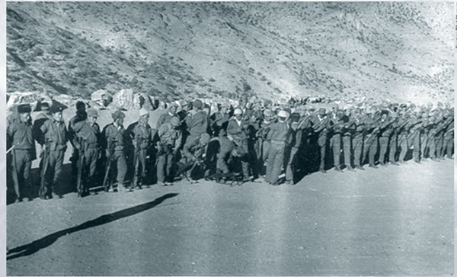
The first years...

The Special Frontier Force (SSF) is a Tibetan paramilitary force created on November 14, 1962, during the Sino-Indian conflict. It is the brain-child of B.N.Mullik, the then Director of the Intelligence Bureau, who convinced Nehru to raise an elite commando regiment specialised in mountain warfare. It had an initial strength of 5,000 men.