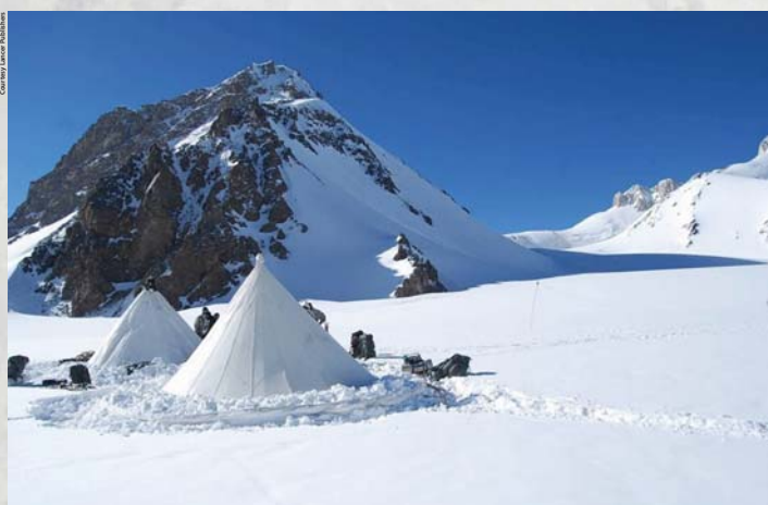
On the glacier

Based in Chakrata, Uttarakhand, the SFF first worked under the supervision of the Intelligence Bureau, and later, the Cabinet Secretariat. The Force fought on India's side during the Bangladesh Operations and more recently during the Kargil War and on the Siachen Glacier.