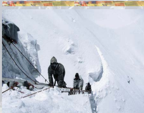
Training in mountain warfare