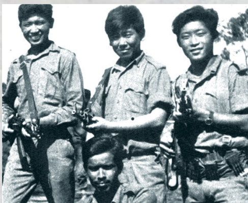
During the Bangladesh Operations

Based in Chakrata, Uttarakhand, the SFF first worked under the supervision of the Intelligence Bureau, and later, the Cabinet Secretariat. The Force fought on India's side during the Bangladesh Operations and more recently during the Kargil War and on the Siachen Glacier.