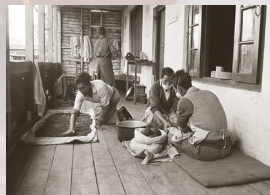
The beginnings of the Tibetan Medical Centre