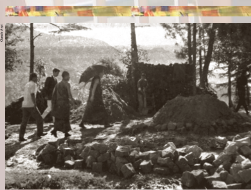
The Dalai Lama inspecting a new construction in Dharamsala

The refugees first settled in the hill stations of Dharamsala, Manali, Mussorie, Dalhousie and other places in the Himalayas.