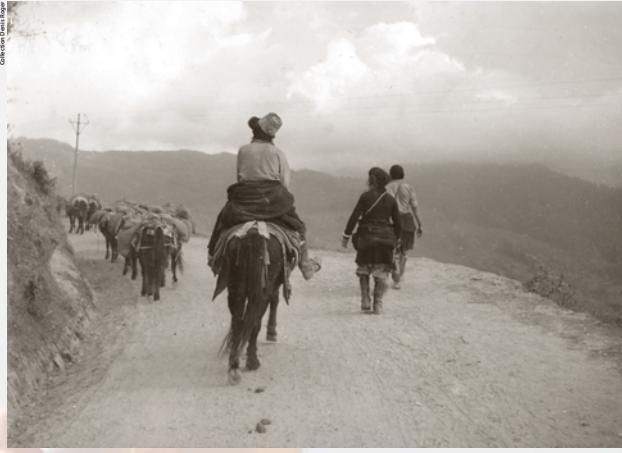
On their way to exile...