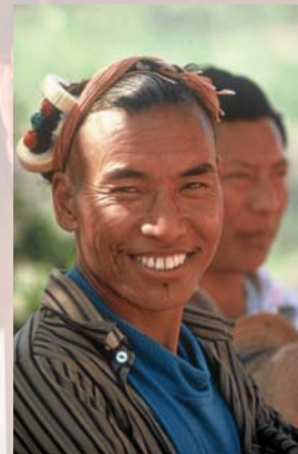
In spite of the tragedy they still find the courage to smile...