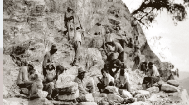
Constructing high-altitude roads

In 1959, tens of thousands of Tibetan men and women crossed the high Himalayan passes to take refuge in India. After a few months in temporary camps in Assam, they found their ways to northern India. The first priority for the Dalai Lama was to preserve a civilization in danger of extinction on the Roof of the World. With the help of the Indian Government and a number of generous sponsors, a new life started.