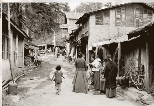
The first refugees in McLeod Ganj near Dharamsala

An exile administration, several schools, a medical institute, a library and monasteries were soon started. Larger settlements were later established in south India.