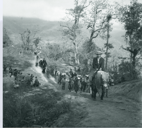
On the way to Bomdila accompanied by the Assam Rifles

After an uprising of the Tibetan population against the Chinese occupiers in Lhasa on March 10, 1959, the Dalai Lama decided to leave Tibet and take refuge in India.