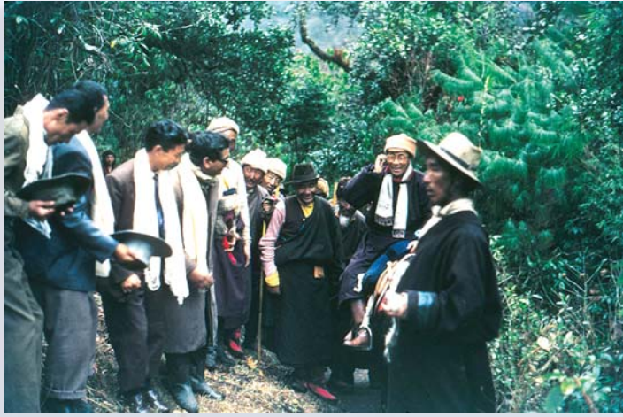
On March 31, 1959, the Dalai Lama crossed the Indian border near Chuthangmu