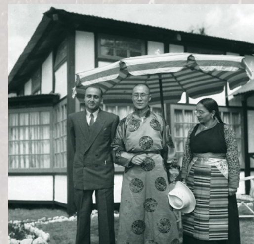
The Indian Political Officer and his wife with the Dalai Lama in Bomdila