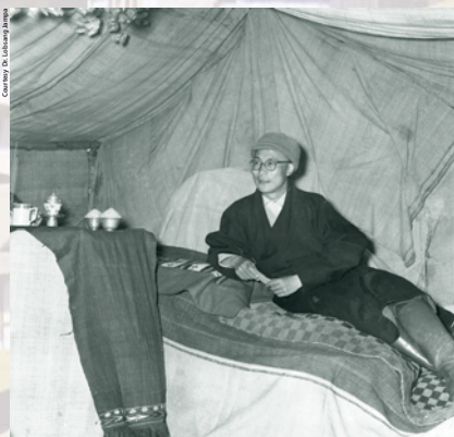
The Dalai Lama resting on the road to Bomdila

He added: "India and Tibet have religious, cultural and trade links extending over a thousand years and for Tibetans it has always been the land of enlightenment, having given birth to Lord Buddha."