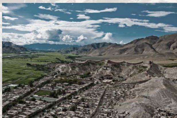
The Indian Mission in Gyantse was washed away by flash floods in July 1954

The catastrophic floods of July 1954 washed out the Trade Agency in Gyantse, killing the Indian Trade Agent and several members of the military escort belonging to the Maratha Light Infantry. The Trade Agency was never rebuilt.