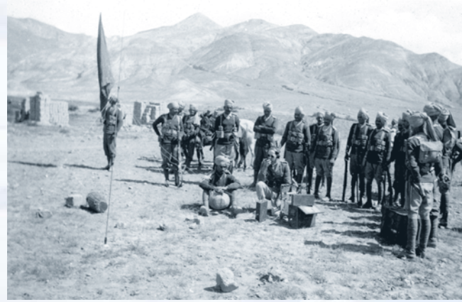
British military escort in the 1930s

Since the Younghusband Expedition (1904), the British (and then Indian) Trade Agents in Gyantse and Yatung were entitled to a military escort.