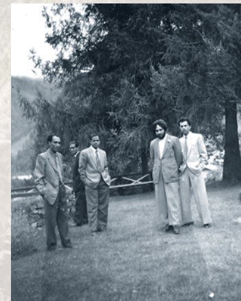
Indian officials posted in Yatung

In the early 1950s, the Chinese People's Liberation Army began occupying Gyantse and Yatung.