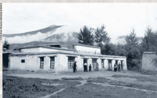
In 1947, the British hospital in Lhasa became the Indian hospital