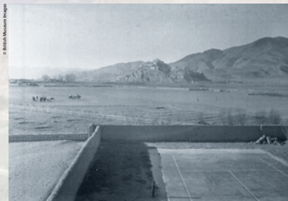
Tennis court for Indian officials in Gyantse