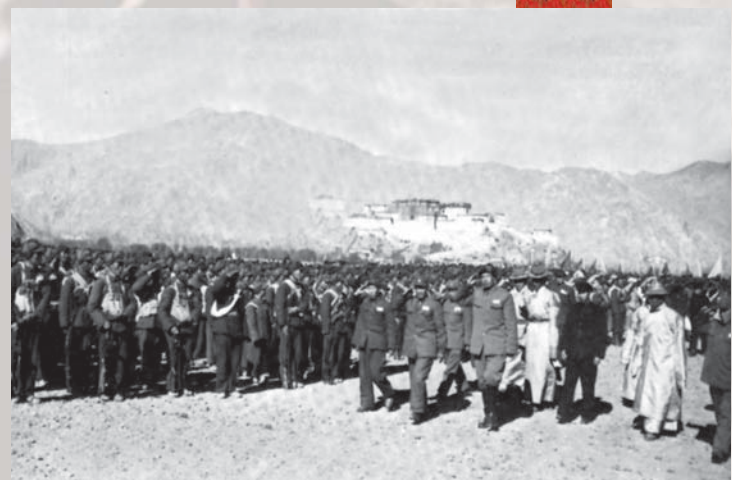
Chinese officials inspecting the 'Liberation' Army (1951)