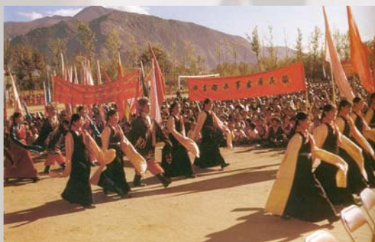
Tibetan girls marching in Lhasa after the so-called 'liberation'

In May 1951, a 17-Point Agreement was forced on Tibetan delegates in Beijing. Tibetan seals were forged for the purpose. Article 1 of the Agreement stated: "The Tibetan people shall unite and drive out imperialist aggressive forces from Tibet; the Tibetan people shall return to the big family of the Motherland — the People's Republic of China."