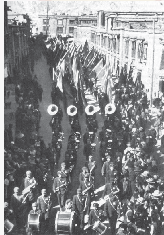
The Chinese troops parading in Lhasa (September 1951)

On October 7, 1950, 40,000 Chinese troops entered Tibet and advanced towards Chamdo, the capital of Kham province. Outnumbered, the Tibetan Army was unable to offer serious resistance to Mao's soldiers. Tibet's independence was lost.