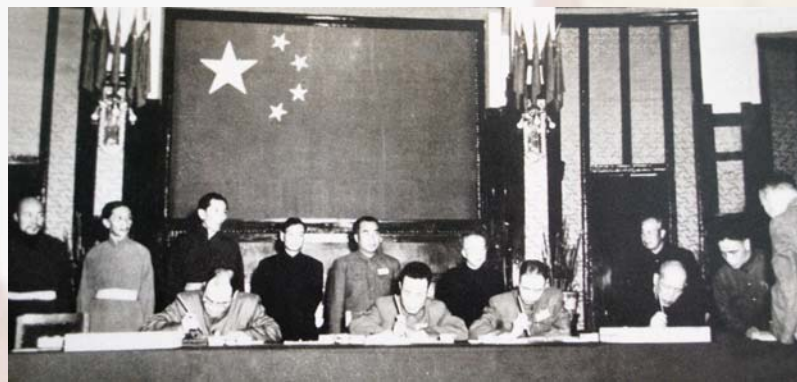
Signature of the 17-Point Agreement

In May 1951, a 17-Point Agreement was forced on Tibetan delegates in Beijing. Tibetan seals were forged for the purpose. Article 1 of the Agreement stated: "The Tibetan people shall unite and drive out imperialist aggressive forces from Tibet; the Tibetan people shall return to the big family of the Motherland — the People's Republic of China."