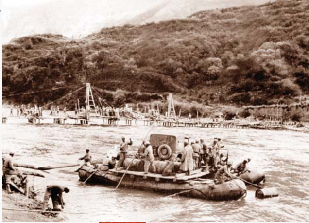
Crossing the Yangze

On October 7, 1950, 40,000 Chinese troops entered Tibet and advanced towards Chamdo, the capital of Kham province. Outnumbered, the Tibetan Army was unable to offer serious resistance to Mao's soldiers. Tibet's independence was lost.