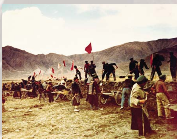
Tibetans engaged in road construction