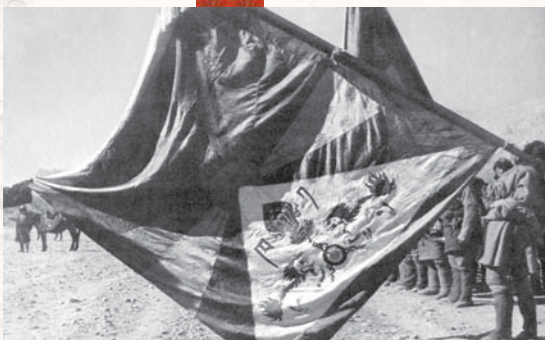
Tibetan National Flag