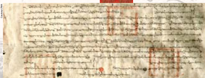
Tibet could enter into treaty relation with foreign countries

Tibet had all these attributes and many more, such as its own postal stamps, currency, decorations, flag, etc. The Tibetan passport was accepted by several countries until 1950.