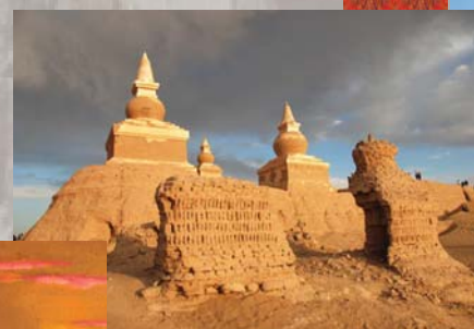
He probably visited these monasteries, saw these dunes in Alashan

Oh White Crane! Lend me your wings I shall not fly far From Lithang, I shall return