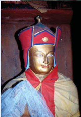
Tsangyang Gyatso the 6th Dalai Lama

Tsangyang Gyatso was born in 1683 in Tawang district of Arunachal Pradesh. He was already an adolescent when he was taken to Lhasa to be enthroned by his guru, the Panchen Lama Lobsang Yeshe, as the 6th Dalai Lama. Still remembered for his exquisite poetry which has been sung for generations around a fire with a few cups of Tibetan beer, he is also considered a great tantric master who could appear at different places at the same time.