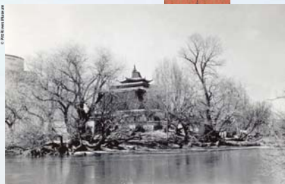
Lukhang Pavilion where he often spent time

In my Palace, the place of Heaven on Earth They call me Rigzin Tsangyang Gyaltso But below, in the village of Shol They call me Dangzang Wangpo, The profligate, for my lovers are many.