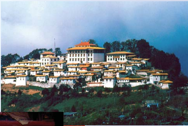
Tawang monastery in Arunachal Pradesh