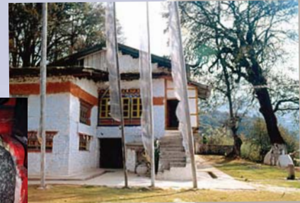
Ugyeling near Tawang where the Dalai Lama was educated