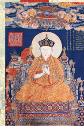
Shakya Yeshe, Tsongkhapa's disciple was conferred titles and given a black hat by Emperors Yongle and Xuande