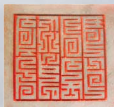
Type of seals presented by the Chinese emperors