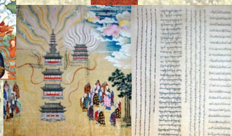
While in Nanking, the Karmapa performed some special rituals for the Emperor Yongle