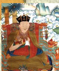
The Fifth Karmapa Deshin Shekpa