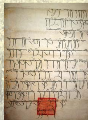
Letter sent to a Sakya hierarch by the 'Imperial Tutor'