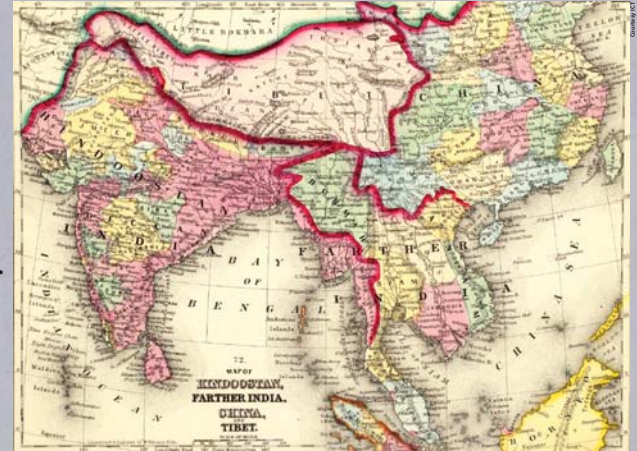
Map showing Tibet as an independent entity

The Phagmodru princes ruled Tibet for nearly a century, before being replaced by another dynasty, the Rinpung in 1481. From 1565, until the advent of the Fifth Dalai Lama in 1642, the princes of Tsang ruled Tibet.