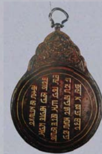
Seal in Phagpa scripts given by a Yuan Emperor