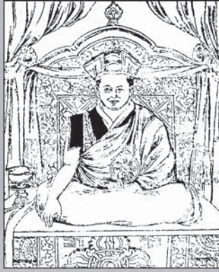
Changchub Gyaltzen, founder of the Phagmodru dynasty

As the power of the Yuan Dynasty declined, the princes of Phagmodru challenged the power of the Sakya hierarchs. In 1358, Changchub Gyaltzen marched to Sakya and emerged as Tibet's new ruler.