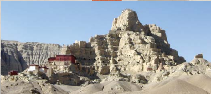
The ruins of Tsaparang monastery in Western Tibet