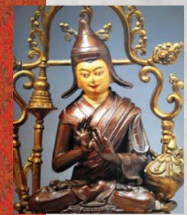
The Bengali master Atisha Dipankara

After Lang Darma killed his brother King Ralpachen in 838 AD, Buddhism was eradicated from Tibet. For more than one and a half centuries, the State lost its political homogeneity; it became fragmented into principalities which continuously fought among themselves. But an empire is truly great when the spirit which built it can survive destruction and reappear under a new and more complete form. It is what happened in the Land of Snows. At the end of the 10th century, the old king of Ngari, Lhalama Yeshe Od was instrumental in the revival of Buddhism in Tibet. Young Tibetans were sent to meet saints, yogis and scholars in the great Indian Viharas . They brought back original Buddhist scriptures which were translated into Tibetan. The most famous amongst them was Lotsawa Rinchen Zangpo.