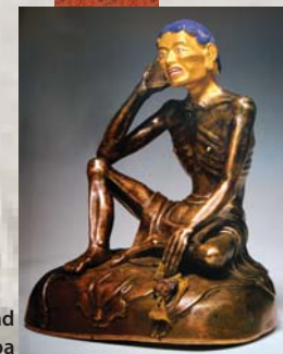
The great poet and yogi Milarepa

The spiritual renaissance originated from the Himalayan regions of Spiti, Kinnaur and Ladakh in India and Ngari and Guge in Tibet: these areas had been spared the Muslim invasions. Many renowned teachers participated in this movement; amongst others, the Indian monk Atisha Dipankara; the Tibetan layman Marpa and his disciple Milarepa. Their lives exemplify the continuous crisscrossing of men and ideas across the Himalayas and how the Buddha Dharma was preserved in its integrity.