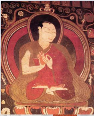
The Great Translator Rinchen Zangpo