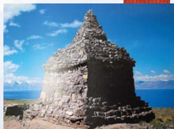
Bon monuments are often found near lakes

Bon is considered the native faith of Tibet which has survived till the present day. For some, Bon is only a body of folk beliefs such as divination, propitiations, offerings, curses; for others, Bon is seen as a more complex religious system with priests called Bonpo, who are believed to have supernatural powers. For still others, Bon is a belief system which matured in the 11th century; this 'organized Bon' has characteristics closely resembling Tibetan Buddhism.