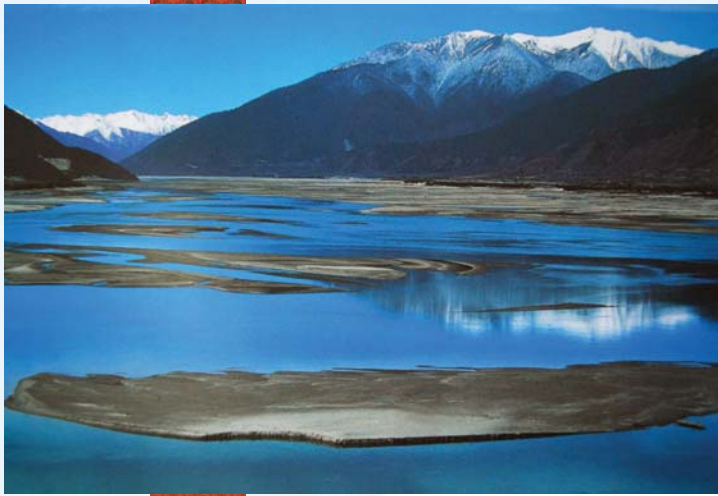
Bon followers worshipped lakes and mountains. Here the sacred Yarlha Sampho peaks