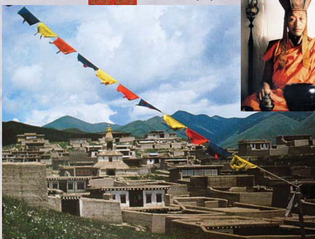
Nangshig Bon monastery in Northeastern Tibet