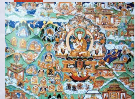
Sherab Gyaltsen, the founder of the Menri monastery in the 15th century

Some scholars divide the history of Bon into three periods. First, the pre-Buddhist era where Bon was a folk religion; the second period was characterized by the emergence of an organized priesthood and a more sophisticated doctrine. It was during this period that the Bon establishment confronted, often violently, Buddhism. The third stage took place after Buddhism became the State religion. Adherents of Bon had to assimilate several Buddhist features to ensure their survival. In turn Buddhism was deeply influenced by Bon.