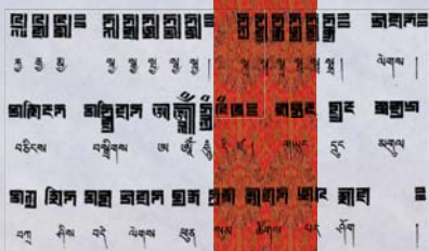
Maryig scripts used by the Bonpos

Early Bon was closely linked with the Kingdom of Zhangzhung and later with the Yarlung Dynasty. Future research on Zhangzhung may shed more light on the historical relationship with other Himalayan beliefs and civilizations.