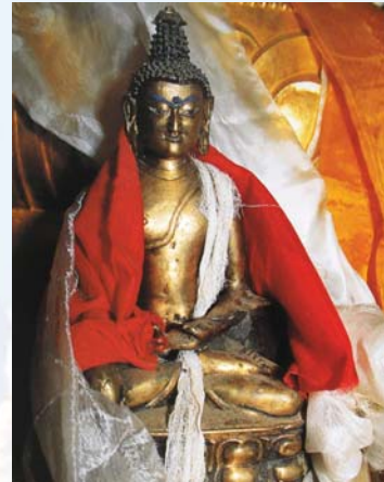
Tonpa Sherab Miwoche founder of the Bon Faith