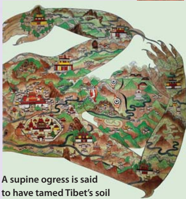
A supine ogress is said to have tamed Tibet's soil by lying on her back to make it habitable

Tibetans have an 'imagined common history', they descend from a male monkey, an incarnation of Avalokitesvara who married a mountain ogress. Their six offspring were the first Tibetans. The inhabitants of the Tibetan plateau are said to have the characteristics of both their ancestors. Except for the divine origin in the Tibetan legend, the modern Theory of Evolution is not too different.