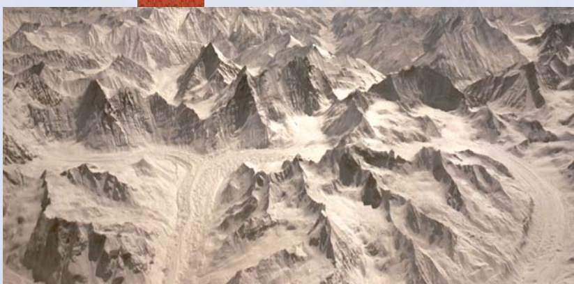
The Roof of the World emerged millions years ago