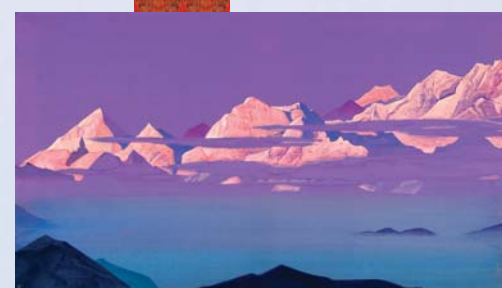
The most awesome mountains of the planet