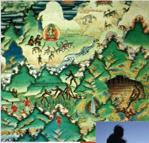
The Divine monkey mated with the mountain ogress to produce the first Tibetans