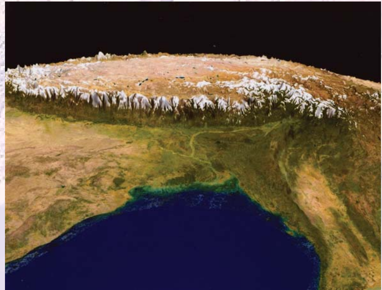
The Tethys Sea was lifted up to become the Roof of the World